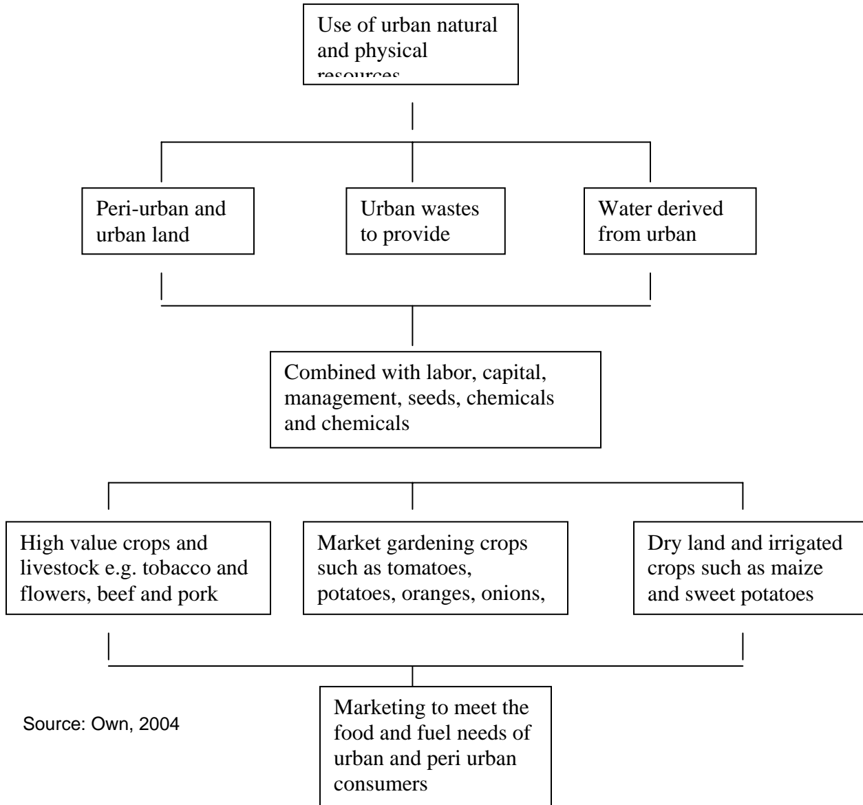
Figure 2 Components of Urban Agriculture

From Figure 2, it can be argued that sustainable urban agriculture consists of management of natural and physical resources in urban and peri-urban areas, production of crops and livestock and marketing of these products to meet the day-to-day needs of urban consumers.