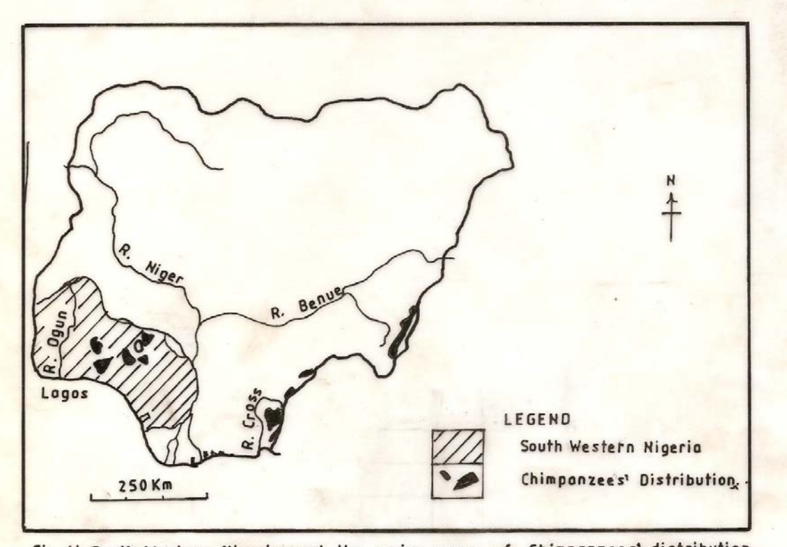
Fig. 1: South Western Nigeria and the major areas of Chimpanzees' distribution in Nigeria.

The southwestern Nigeria chimpanzee environment comprises of the lowland rainforest, stretching from the coast to about 50 km inland in it western boundary near the Dahomy Gap, to about 150 km inland around the region of the Kukuruku hills and further stretching to the western bank of Niger River as it eastern boundary (Figure 1). Rainfall is usually between 1,500-2,500 mm and capable of sustaining the rainforest environment under natural condition, distributed over 8 - 9 month period (March – October/November) and depending largely on the distance from the coast. In the times past, vegetation in the zone falls within the lowland rainforest (Keay, 1959; White, 1983). However, the present physiognomic component of the environment, particularly in region of Kukuruku Hills, is mainly that of forest/savanna mosaic. The southern parts still have large, continuous patches of reserved forests that had been variously degraded as a result of timber exploitation and encroachment for farming. The impacts of human activities have contributed seriously to the degraded value of the forest environment.