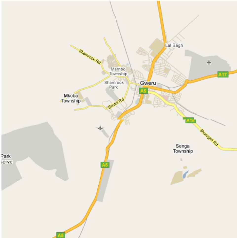
Figure 1. Location of Midlands State University scale: 2cm represent 2km