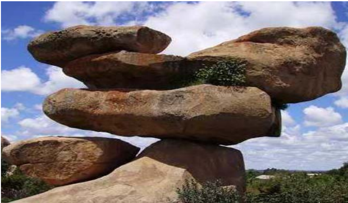
Plate 1 Chiremba Balancing Rocks in Zimbabwe

Domboremari consist of three sets of rock, which are featured on all Zimbabwean paper currency notes. This feature makes the Zimbabwe currency unique because most currencies in the world carry heads of kings, queens, and presidents. Domboremari rocks are located on the western side of the site. The Flying boat formation is spectacularly balanced boulders resembling a boat, located in the southwestern corner. Epworth primary and secondary schools in the area also use them as logos. The Amphitheatre is a combination of boulders and balancing rocks located in the northern part. The most notable rock paintings, although affected by ravages of natural decay and vandalism, are found on Devil's Rock. They show some peculiar animal headed figures with long spindly legs and arms, as well as ordinary human figures. The paintings are not as spectacular as those found in northern Zimbabwe; however, the figures with elongated limbs may symbolize hallucinations in a trance-like state. Other paintings are found north of the Amphitheatre and depict the standing figures with the upper part of their bodies elongated and their legs very short and fat (Plate1).