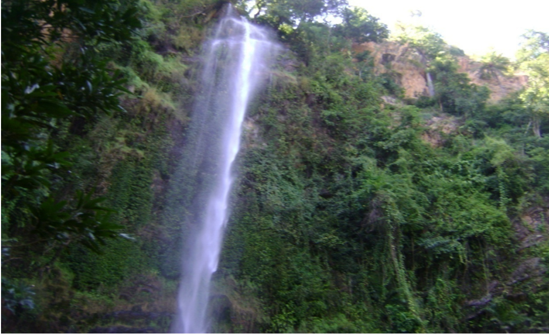
Fig 2: Owu falls in Kwara State