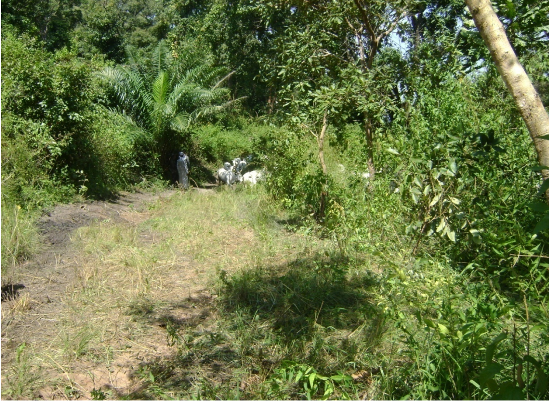
Fig. 3: Road to Owu falls