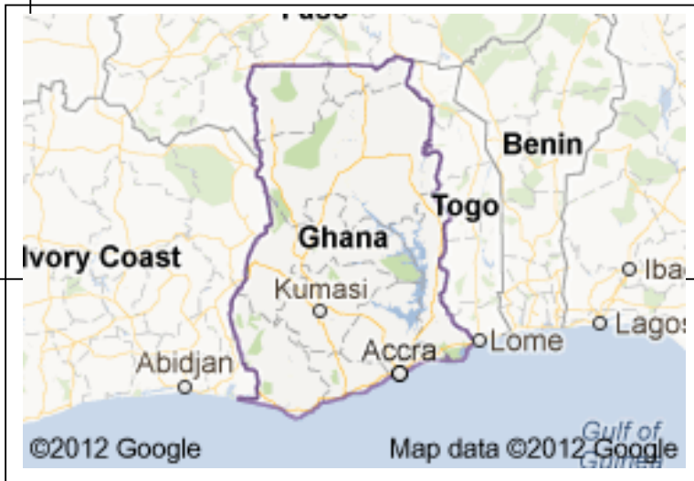
Figure 3: Map of Ghana Showing Boundary Countries