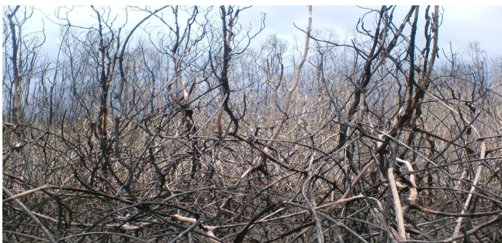
Plate 1: Bomadi: Effects of oil spillage from Shell pipeline 7 weeks after (Tuodolo, 2008)

Aside these, there are environmental problems that result in the slow poisoning of the waters and destruction of vegetation and agricultural lands by spills which occur during petroleum operations (Ademanwu, 2001). Chief among these is oil spillage which has over time, constituted a major source of environmental degradation in the Niger –Delta. Spills of oil experienced in Nigeria are those caused by burst pipeline, tanks, tankers, drilling operations, etc. Although these bursts and spills have occurred with different intensities, they are common phenomena and have resulted in loss of life and properties through water and land pollution that poses grave consequences for both aquatic and terrestrial life. In some cases, groundwater is also polluted causing well water to be covered with a thin film of oil; while in some other cases, the soil and vegetation are rendered useless because oil spill had made significant contact with fauna and flora components thereby creating a desert like situation in the mangrove rainforest.