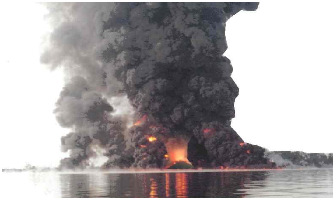
Plate 2: Nembe: Shell pipeline fire December 21, 2005 (Tuodolo, 2008)

Gas flaring is also a regular rather than episodic event in the Niger Delta. To date, up to 75% of the gases associated with the Nigerian oil is flared off. This is so because for many years, gas associated with oil was not captured as a resource, but regarded as nuisance and a natural consequence of oil exploitation. Later, the conversion of these gases into resources was also associated with the unintended explosion of gas pipelines as occurred on several occasions in Oleh, Isoko South Local LGA of Delta State (CLO, 2002) or through deliberate vandalization of oil and gas pipelines. When gas leaks or flared through mechanical accidents or deliberate sabotage by the irate local communities, the consequences are untold and may include the introduction of an unprecedented amount of hydrocarbons and ambient air pollutants into the air and land of the Niger Delta.