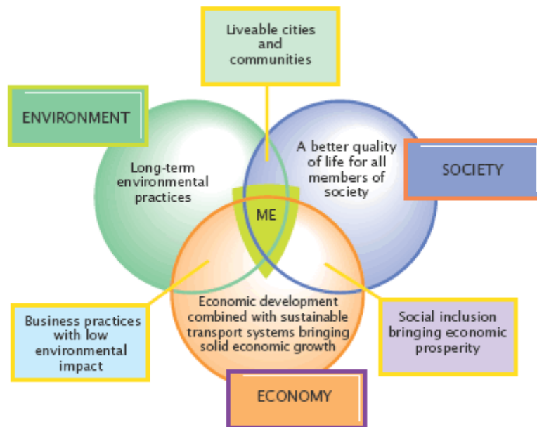
Figure 1: Sustainable Tourism Development