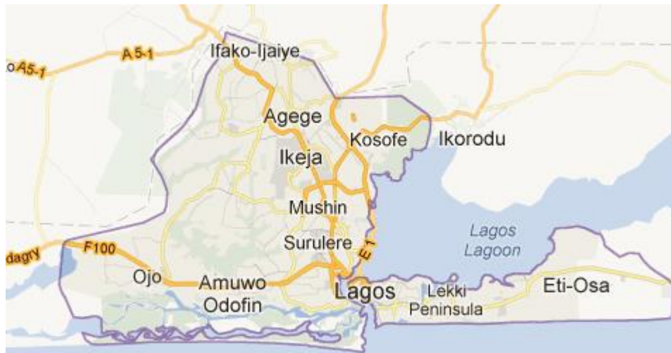
Figure 3: Map of Lagos State

Survey is one of the most cost effective ways to obtain information from a large number of people, it gives better results - more specific, accurate, faster and most cost effective ways, (McQueen and Knussen, 2002). The survey in this research work covered a sampled hotel and tourist centres in Lagos state.